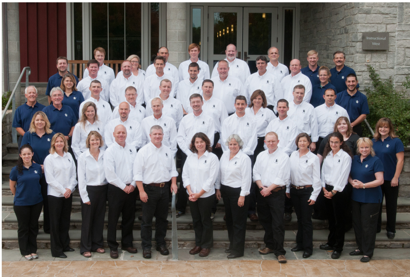
NCLI STAFF AND COHORT 7 FELLOWS AT THE NATIONAL CONSERVATION TRAINING CENTER