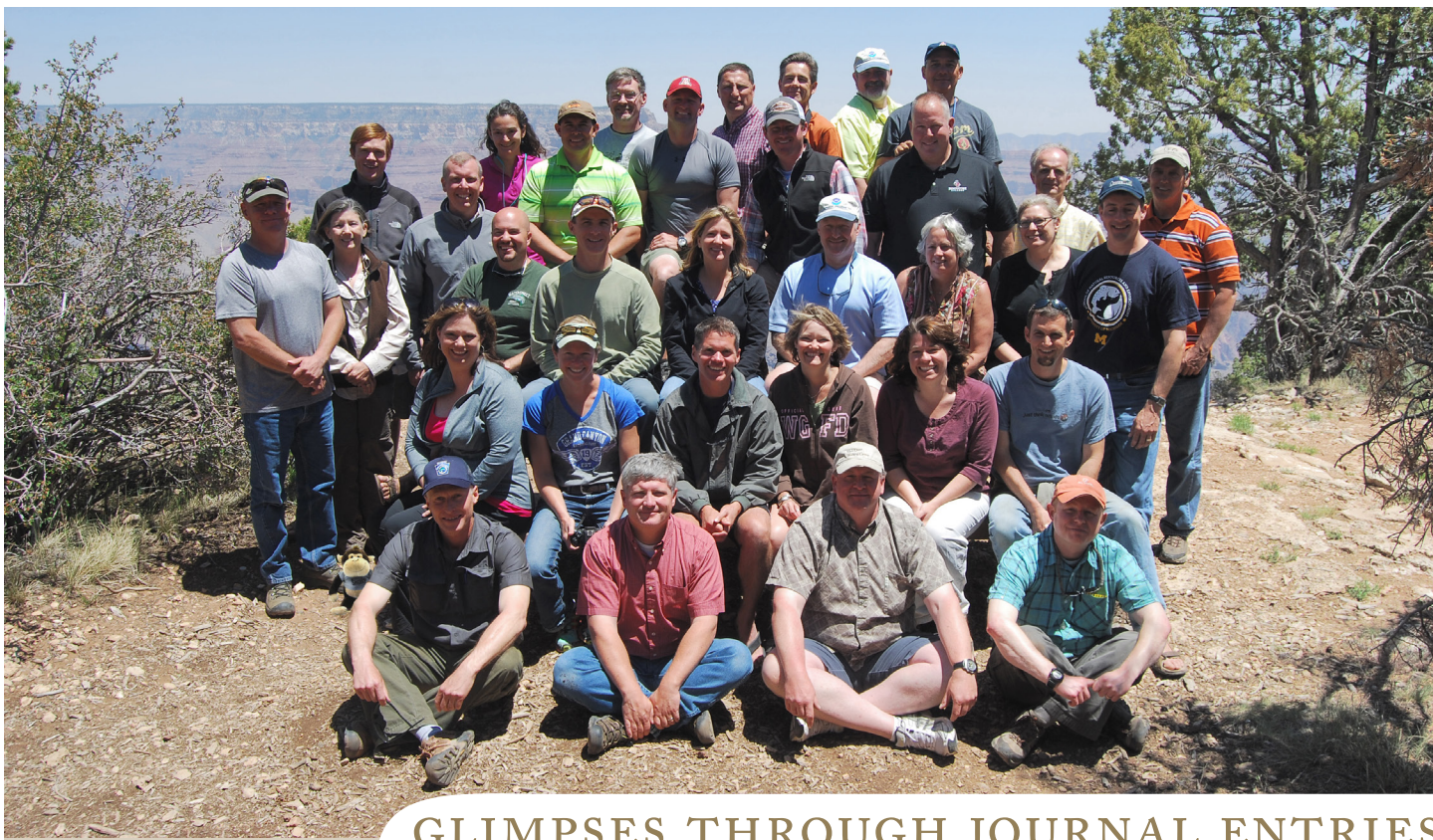
THE FELLOWS OF COHORT 7