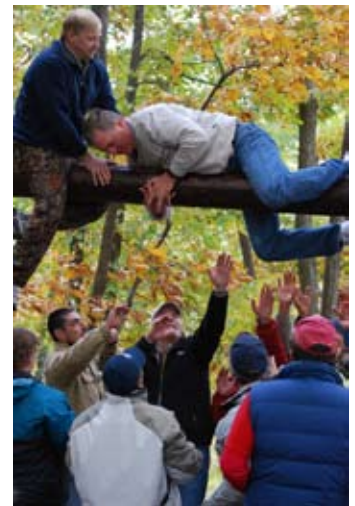
NCLI COHORT 4 FELLOWS AT ROPES COURSE