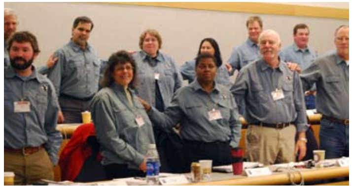
NCLI COHORT 4 FELLOWS

CURRICULUM Answers to the question, “What will it take to prepare them?” formed the base for the curriculum design. A number of NCLI distinctions from other good leadership development programs are the NCLI’s design, its participant diversity, its context of natural resource conservation, and its departure from teaching leadership as a set of traits or skills.