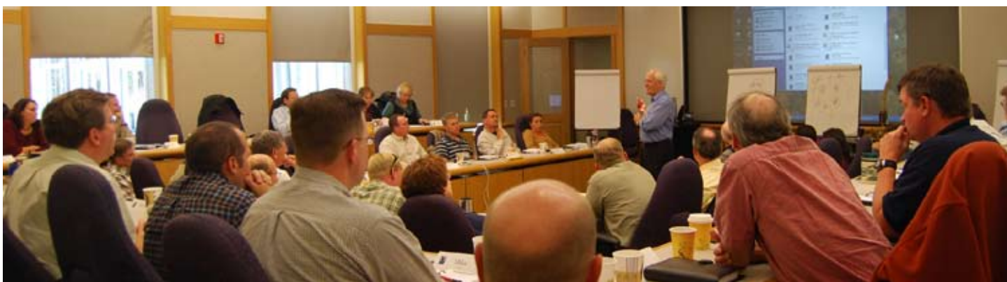
NCLI COHORT 4 FELLOWS