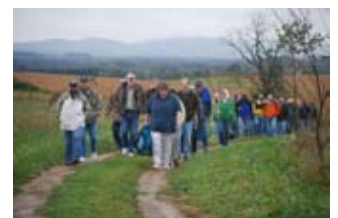
NCLI COHORT 4 FELLOWS