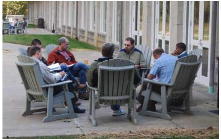
AN NCLI COHORT 4 PEER GROUP

PEER GROUPS: Six subgroups, or peer groups, learned to give each other candid feedback as they discussed their individual leadership challenge projects. In the process, most developed into life-long, high trust relationships that would be invaluable to them as they continued along their professional journeys.