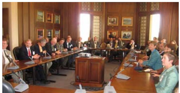
NCLI COHORT 4 FELLOWS MEET WITH THE SECRETARY OF THE DEPARTMENT OF THE INTERIOR